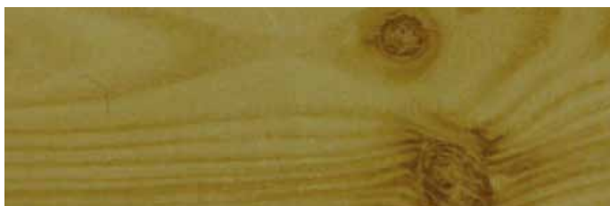
STEP 3: The coated aluminium