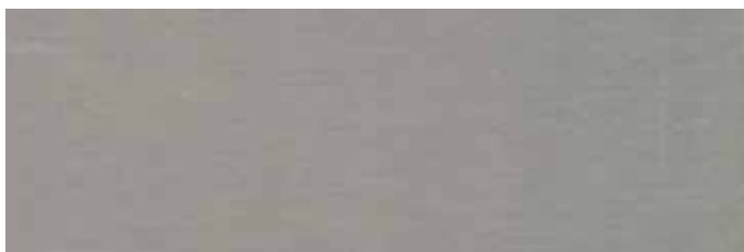
STEP 2: The aluminium is pretreated