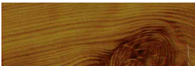
STEP 4: The finished design applied to the aluminium