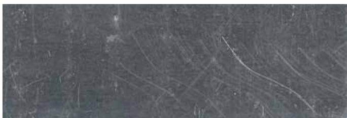
STEP 1: Raw aluminium